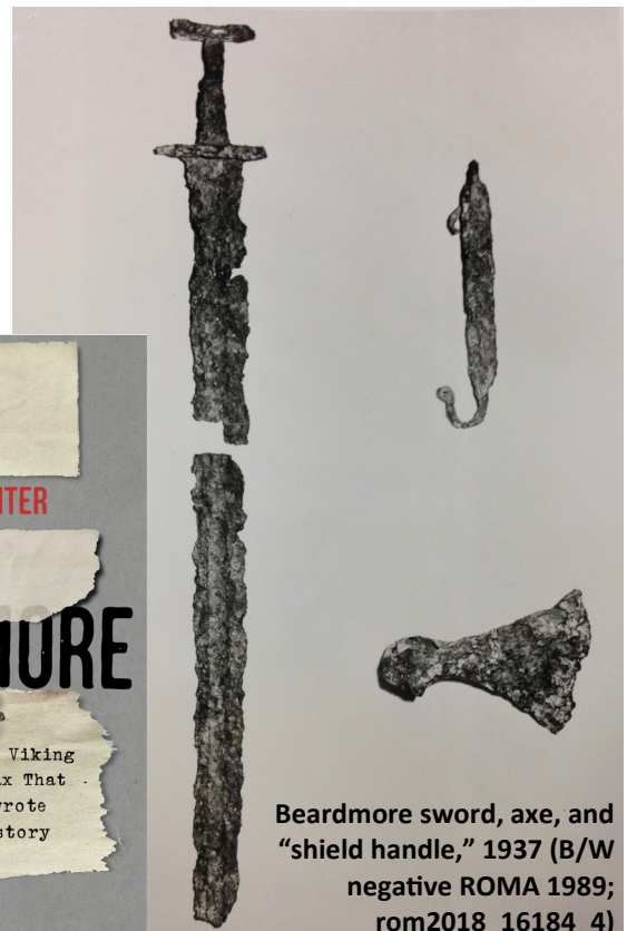
Beardmore sword, axe, and "shield handle," 1937 (B/W negative ROMA 1989; rom2018_16184_4)

We encourage all interested persons to attend Toronto Chapter meetings free of charge and invite you to become a member of the OAS and the Chapter. Bring a friend!